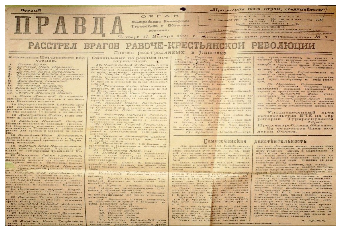
Newspaper copy. The archive of the President of Republic of Kazakhstan. F. 139. Op. 2. D. 9. P.1. The list of executed in Pishpek. Naryn rebellion participants.

The Soviet Party was open about its tactics, which included mass terror and violence. They printed the full list of those executed in the official state newspaper in order to intimidate the opposition. Those few who managed to escape this tragedy alive fled to China. However, the Red Army was not satisfied and conducted punitive operations targeting political refugees even on the other side of the border. Perhaps, the sheer magnitude of the violence is the reason it is still remembered among Kyrgyz people today. That is why "Mondurov's revolt" plays such an important role in translation of cultural memory. It is a catalyst, which vividly brings out other historic events of 1918-1920 that otherwise would be forgotten. It is unknown whether K. Bondarev survived on the territory of Xinjiang or was killed by the Red Army soldiers. However, to this day among Kyrgyz refugees living there, the Middle Ürkün is often referred to as "Mondurov's revolt".