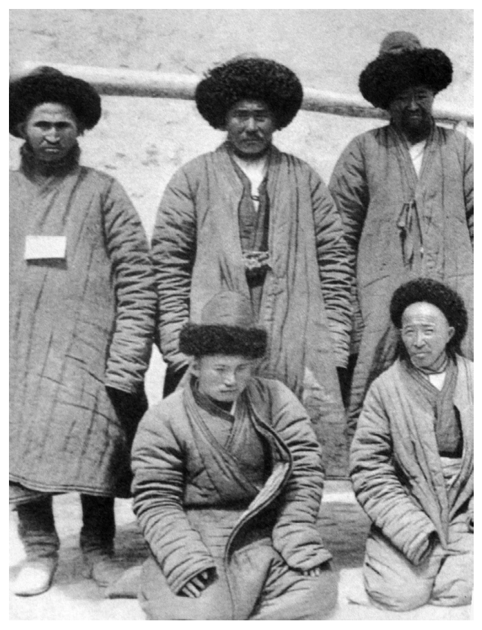
Kyrgyz men of Üch-Koochu.1907. // Xinjiang People Publishing House. 2006. p. 8.

The Great Ürkün took place during the rule of the Russian Empire. The tsar ordered Kyrgyz people to send their children to work on the frontlines the war. They refused to comply, and a revolt ("munt" in Kyrgyz) broke out. "Send your son he'll die, refuse – you'll die" (Barsa bala ölöt, barbasa chal ölöt) is what people said about that period. The other two Ürküns, known as the Middle and the Minor, occurred during the Soviet occupation. When reminiscing on hardships they endured during those times elders said: "Mournful blood run through our veins" (Bizdin kanybyz kaygyga jyk tolgon), and "Kyrgyz soup will burn your tongue even in 40 years" (Kyrgyzdyn shorposu 40 jyldan kiyin ooz küygüzöt). Is not easy to convey the full meaning of these expressions to younger generations.<sup>3</sup>