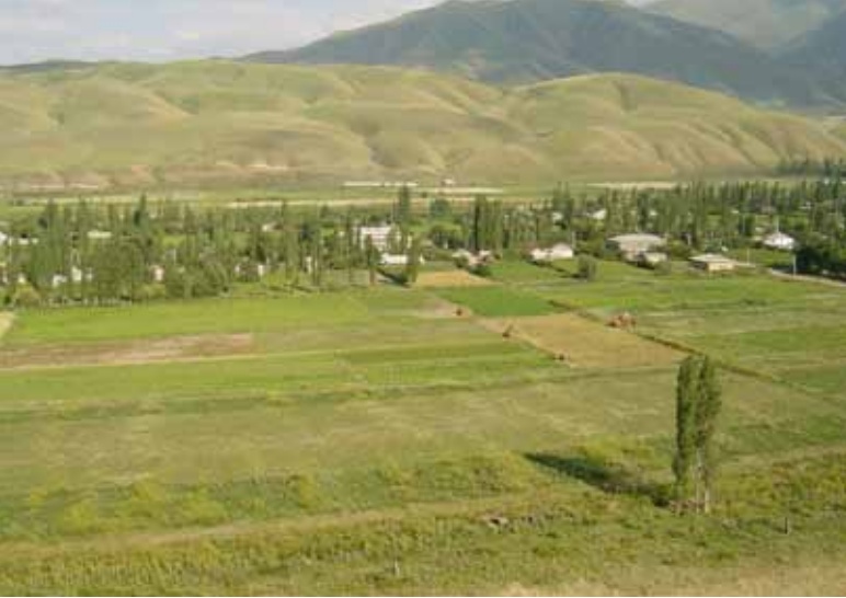
Small agricultural plots and near-village pastures. Sokuluk watershed, Chui oblast, Kyrgyzstan (Jyldyz Shigaeva)