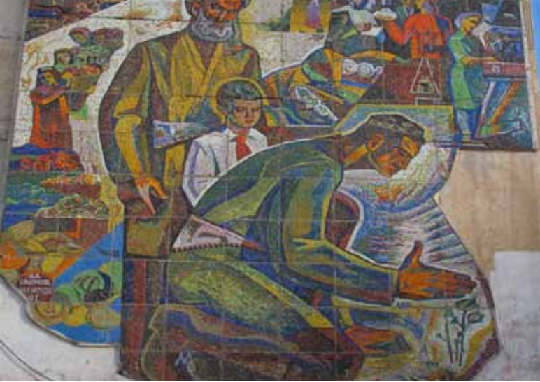
Soviet-era mosaic on a house depicting the importance of agricultural productivity, Dushanbe, Tajikistan (Bettina Wolfram 2011)