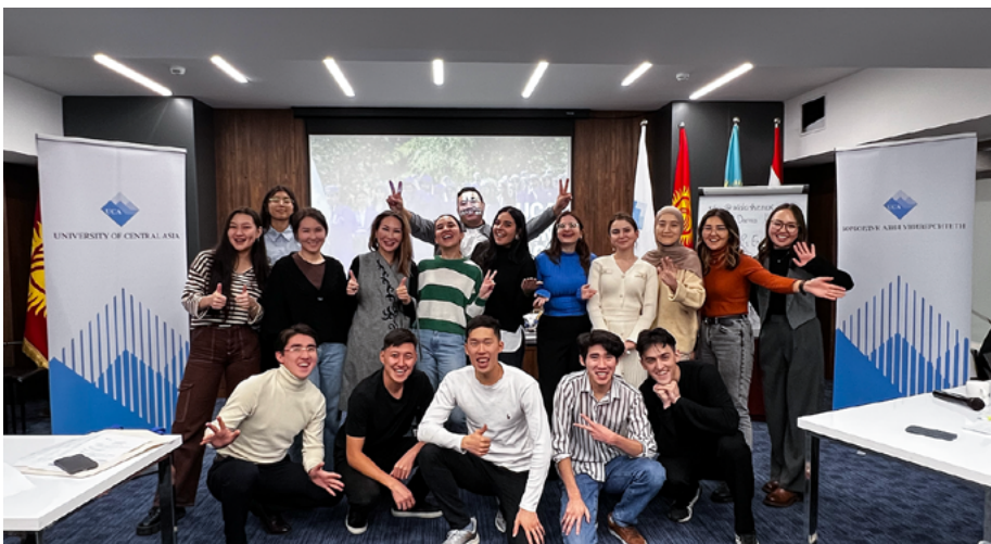
Alumni Reunion - Kyrgyzstan.

The reunion included hands-on workshops by field experts from a range of specialisations including design thinking, professional branding, product and project management, and stress management. The workshops concluded with vibrant networking sessions with UCA's esteemed corporate partners, fostering valuable connections and potential collaborations.