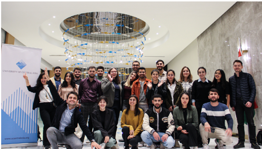
Alumni Reunion - Tajikistan.

ative Education Programme Department, the two-day event was a seamless blend of professional development opportunities and cherished reminiscences.