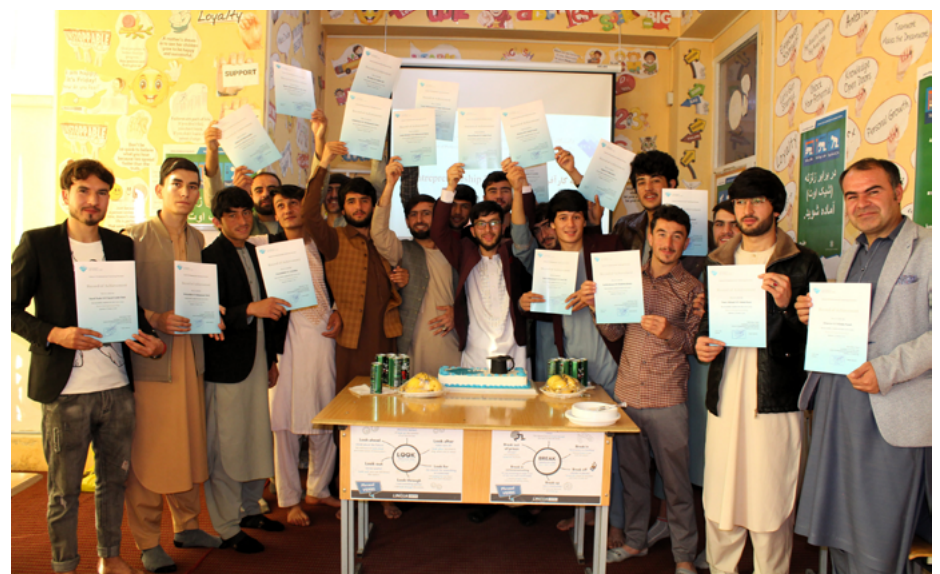
SPCE graduates in Afghanistan sharing a moment of joy and pride following their successful completion of the programme.

"This programme has not only equipped me