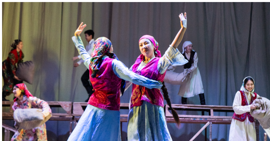
"Jamiliya" performance by UCA and NSU students.

The Art Faculty at NSU collaborated with students from UCA, NSU, and local schools to create artworks dedicated to the writer. The celebrations concluded with an event in the Naryn Drama Theater with stage captivating performances based on Aitmatov's iconic story of "Jamiliya". The event was followed by musical performances celebrating Aitmatov's legacy through songs inspired by his writings.