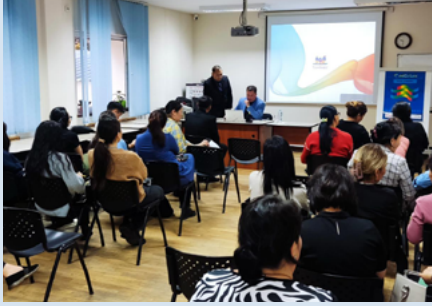
English language teachers participating in SPCE training programme in Tekeli, Kazakhstan.

UCA's School of Professional and Continuing Education (SPCE), in collaboration with the Education Departments of Zhetysu region, Kazakhstan and Zhetysu University recently organised advanced training sessions for English language teachers in the region. The objective of this learning session, attended by more than 200 educators from secondary schools, colleges, and universities, was to enhance their language instruction standards.