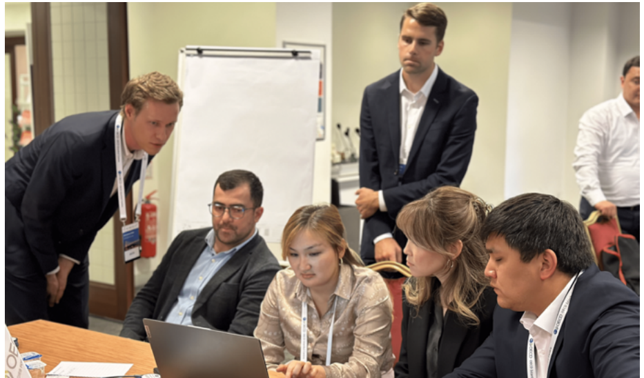
SIPA summer school participants engaging in discussion of policies on transport decarbonisation.

In addition, IPPA, in collaboration with the