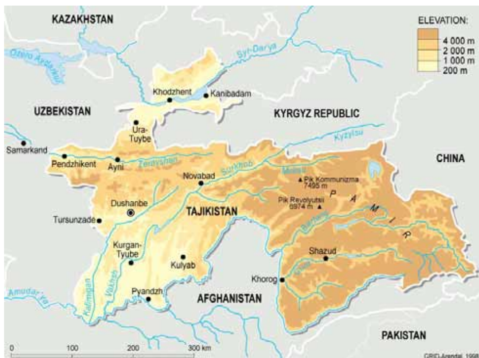
Figure 5: Map of Tajikistan elevations in metres (UNEP 2011)

The predominant vegetation types found in the mountains are desert, semi-desert and steppe on all the lower slopes and foothills and in some of the outlying ranges and major basins (Conservation International 2011). Patches of riverine woodland survive in the Ili valley in Kazakhstan, and a few other places. At higher altitudes, steppe communities, dominated by various species of grasses and herbs occur, while shrub communities are widespread in the lower steppe zone. Spruce forests, the only coniferous forest type, occur on the moist northern slopes of the Tien Shan, while open juniper or archa forest occurs widely between 900 and 2,800 m.a.s.l. (meters above sea level). Subalpine and alpine meadows occur in the western part of the mountains, from 2,000 to 4,000 m.a.s.l. and above. At the very highest and coldest elevations, there is limited vegetation cover and diversity, with cushion plants, snow-patch plants and tundra-like vegetation.