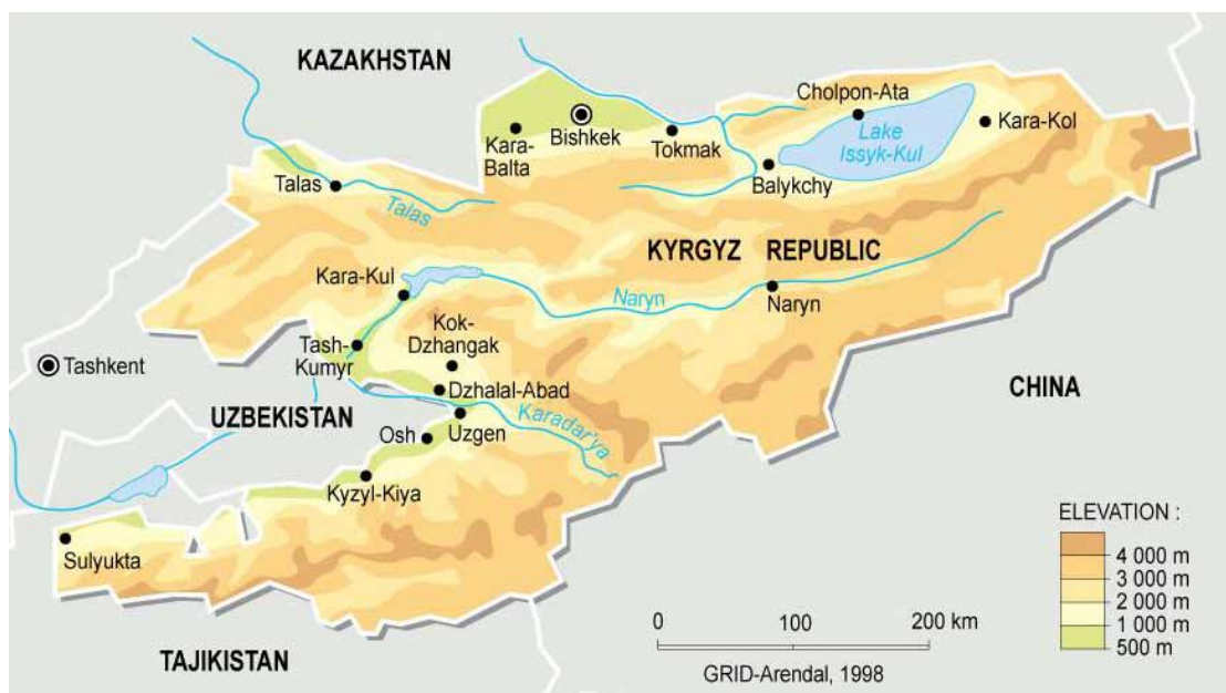
Figure 4: Map of Kyrgyzstan elevations in metres (UNEP 2011)

Kyrgyzstan’s pastures cover an estimated 49 percent of the country, (93,650 sq km) or about 80% of agricultural land (Miller 2001). An additional 12 percent of the country is classified as forest land without forest cover, which means they are largely shrub lands utilized as grazing land. Most of the rangelands are located at altitudes between 1,000 and 3,500 m, in intermontane valleys and mountain slopes. About one-quarter of the country’s rangelands are found at elevations greater than 3,500 meters.