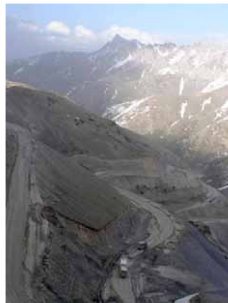
Figure 1: Mountain road between Tajikistan and Kyrgyzstan (Carol Kerven)

But there are also severe drawbacks to making a living on mountain land. The higher level of precipitation results in deep and long snowfalls in winter, which can cut off human communities for long periods. Some livestock species or breeds cannot forage under deep snow, and are not physiologically equipped to cope with long and intense cold periods. At the higher altitudes, the short frost-free period of between 88-101 days in summer results in a limited growing season for annual vegetation, affecting planted crops as well as natural pasture (Khukmatullo et al. 2005). Transport is impeded by steep and dangerous terrain, and routes may be blocked by avalanches and rock falls in winter and spring. Remoteness and inaccessibility can lead to social isolation and political marginalisation.