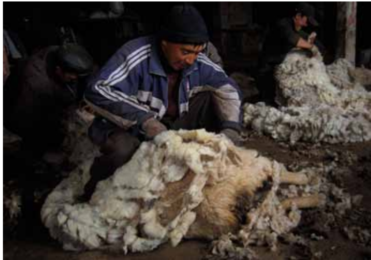
Figure 12: Hired worker shearing merino sheep, Naryn Kyrgyzstan

By the middle of the 2000s, however, international prices and demand for fine wool increased (World Bank 2007) After the international rise in wool prices, large-scale sheep herders are now returning to raising fine-wool white sheep as the demand for wool increases and richer mountain farmers with larger flocks were able to benefit from selling merino wool (GL CRSP 2005 and 2006).