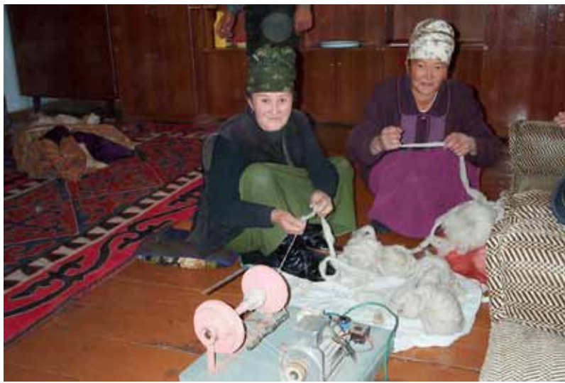
Figure 16: Women spinning sheep wool, Chong Alay valley, Kyrgyzstan (Carol Kerven)

Within Kyrgyzstan, the establishment of the Kyrgyz Land Code (1999), Law on Use and Management of Agricultural Land (2001), and Resolution #360 on Pasture Management and Use (2002) provided de jure equity for women with regard to access to pasture and agricultural land. As WESA (2005) found in a study in Chui Oblast and as was corroborated by Giovarelli's (2004a) interviews with women in every oblast in Kyrgyzstan, however, even when women did operationalize their legal access to land, economic barriers limited women's access to agricultural assets, inputs, and resources. Further, the reinvigorated and de facto prevalence of customary practices and customary law in independent Kyrgyzstan limits women's control of and role in political decision-making regarding agro-pastoral lands and resources. This is primarily because customary property rights, including animal and pastureland use rights, are attributed through male relatives (Giovarelli 2004a; Undeland 2008). Kanji (2002) similarly concludes that in post-Soviet Gorno-Badakhshan, Tajikistan, the intensification of women's workload—partly as a result of women's recent involvement in trading and other market-based economic activities compounding their household and farm-based responsibilities—and their increasing relative poverty have reduced women's participation in the political sphere, even at a local level.