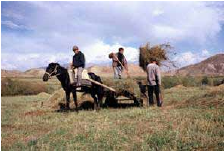
Figure 7: Hay harvesting, Naryn, Kyrgyzstan (Bernd Steimann)

Mineral mining is a strong contributor to pasture degradation in Kazakhstan (Karnieli et al. 2008). Burning of pastures is now a regular feature of the Kyrgyz autumn and fires sometime cover many square miles of mountain and foot hills, despite being forbidden under law (FAO 2006). The pastoralists assess the importance of forage plants on the basis of their availability during scarce seasons and not according to their land cover or watershed management potentials (Drees et al. 2010).