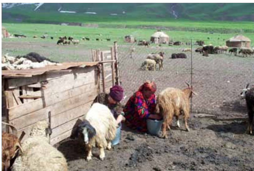
Figure 15: Pastoral women milking goats, Surkhob valley Tajikistan (Carol Kerven)

Simultaneously, the lack of economic opportunity in rural areas has led to massive labour migration to national urban centres and to international destinations, mainly southern Kazakhstan and Russia. While women do make up a significant portion of migrants, migration trends are increasing the number of female-headed households, increasing the burden of women to manage the household, farm, and pasture-related economic practices, and, in some cases, elevating the role of women in household decision-making (Thieme 2008) including decision-making relating to agro-pastoralism.