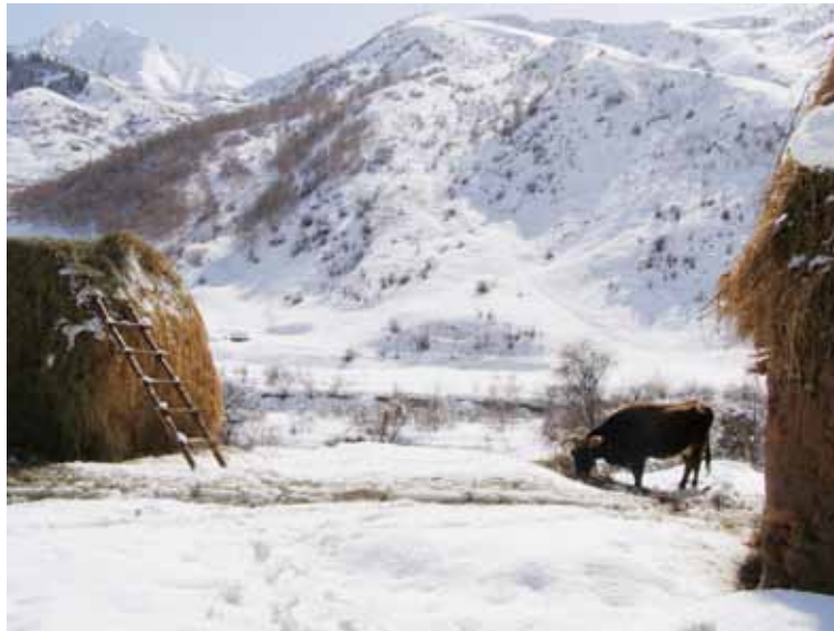
Figure 11: Cow in backyard during winter, Alay mountain valley Kyrgyzstan (Carol Kerven)

Kyrgyzstan's mountain farming systems are dominated by sheep and goats, with fewer numbers of cows per farm, while some yaks and a very few camels are kept in the highest altitude southern Alay mountains. Nationally sheep numbers fell from 10 million in 1992 to 3 million by the late 1990s and have only risen slightly to 3.6 million by 2009 (Schillhorn van Veen 1995; FAOStats 2011). Goat numbers, on the other hand, have risen steadily to three times the early 1990s number, being preferred by poorer mountain farm families as more productive than sheep and easier to raise; local small sample studies find that official statements of goat numbers are much lower than the actual numbers (Kerven and Toigonbaev 2010). Cattle numbers have risen somewhat since the mid 1990s. Horses remain important as sources of transport in the rugged mountain terrain, and there were 362,400 horses in 2009.