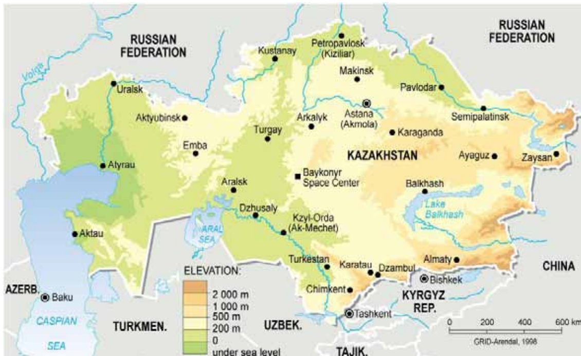
Figure 3: Map of Kazakhstan elevations in metres (UNEP 2011)

mountains provide a contrast to the other Central Asian landscapes of steppes, valleys, deserts, and forests, all of which also contain pastoralists and agro-pastoralists (van Leeuwen et al. 1994; Kerven et al. 1996).