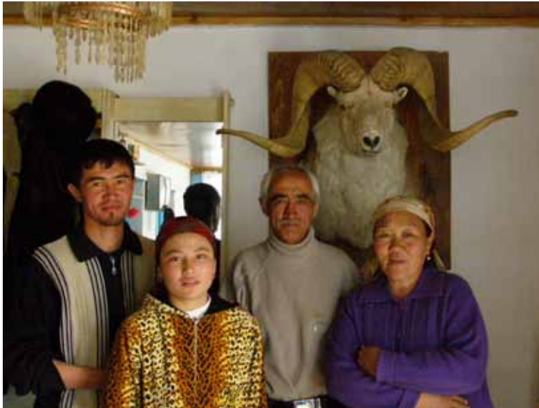
Figure 6: Kyrgyz family in the Pamirs, with Marco Polo wild sheep trophy

“Why should people from Bishkek and Germany come and hunt our animals? When we shepherd our animals through their territory, they stop us at the entrance to the gorge.... They check if we have any guns and only then give us a permission to go further. We are all very upset with this. We have to go through impassable mountains to get to the places where we can hunt without being stopped. Of course we understand that animals should be hunted wisely in a way that not to exterminate them all. But these foreigners don't do anything to preserve them either. If they pay us, villagers we would take care of these animals and they can come and hunt without any problems from us”.