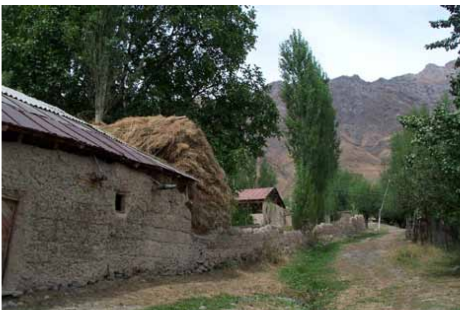
Figure 8: Stored hay in a mountain village, Zerafshan valley Tajikistan (Carol Kerven)

For several case study areas in Kyrgyzstan, pasture grazing pressure is particularly severe during winter and households are obliged to overcome the winter feed scarcity by continuous grazing around villages, storing feed, and destocking (Rahim et al. 2011). A study in the Wakhan mountain region of northern Afghanistan bordering Tajikistan noted that agro-pastoralists may anticipate feed shortages by increasing the quantity of feed stored or destocking, especially when fodder production competes with food production for families' subsistence (Kreutzmann 2003).