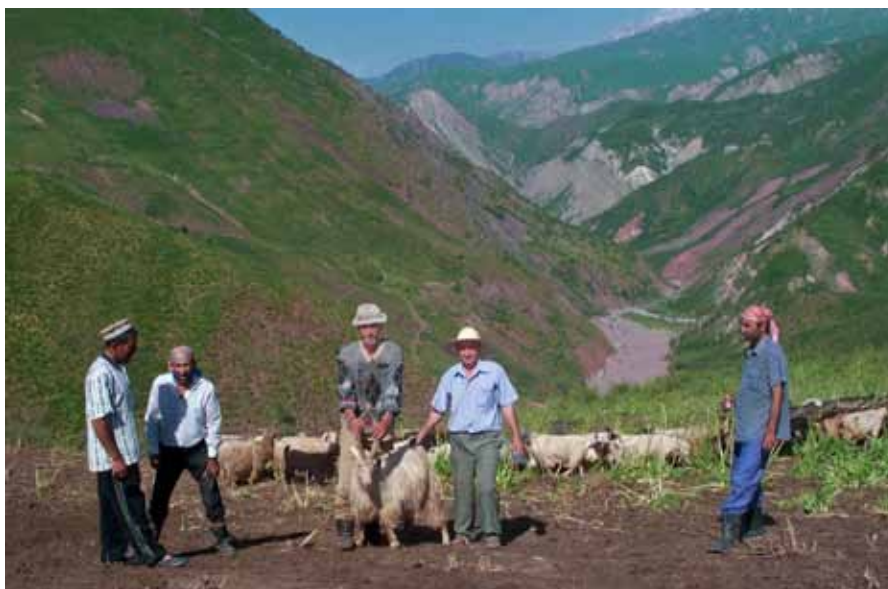
Figure 9: Hired shepherds in summer pastures, Surkhob valley Tajikistan (Carol Kerven)

In Tajikistan the seasonal migration patterns for livestock in the eastern Pamir are different from the western Pamir and north-west Tajikistan. The eastern Pamir is arid, and the high elevation pastures are not only utilized throughout the year for pasturing but the available shrubs are also uprooted for fuel (Breckle and Wucherer 2005). In eastern Pamir the households with large herds are more mobile than the small herds due to their ability to afford the cost and labour requirement for mobility, while the smaller herders are obliged to graze their livestock all year around settlements (Hangartner 2002). In the central and western valleys and mountains of Tajikistan there is some cropping in addition to pastoralism, such that livestock can partly depend on crop residues and by-product feed, and animals are taken to high pastures only during summer times by hired shepherds. Another pattern is transhumant livestock herding with no cropping (Herbers and Nuppenau 2006).