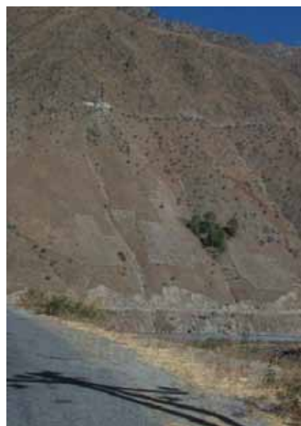
Figure 2: New fields on the mountain slopes in Surkhob valley, Tajikistan

The position of CA mountain households on this livelihood continuum is dependent on socio-economic and agro-climatic factors which frame peoples' choices in the mountain regions. In this paper, we seek to characterise these factors, providing quantitative estimates where possible, to delineate the forces acting upon households' choices and constraints in pursuing agro-pastoralist activities.