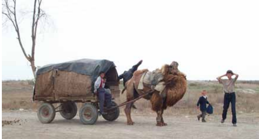
Figure 17: Improved school bus for Kazakh villagers in the desert, who formerly migrated to mountains in summer (Carol Kerven)

general retreat of the state from the agrarian sector led to the disintegration of infrastructure on remote pastures, including roads, barns, wells, and fencing. Several services ceased, which were formerly provided by the state to herders and their families living on remote pastures, such as schooling or transport facilities, which additionally discouraged seasonal migration for many (Kerven et al. 2008).