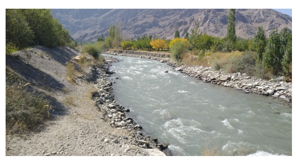
Isfara River with the orchards in the background.

The Isfara river is very important for the Batken region and downstream agriculture in