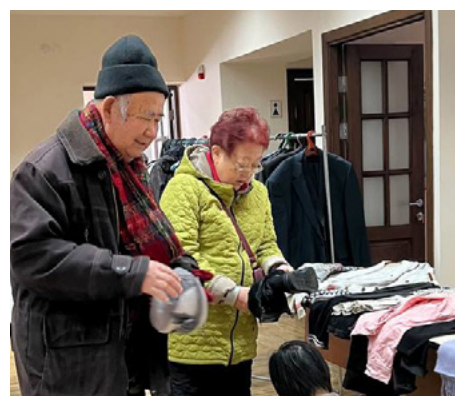
Fair participants accept donated gifts.

The fair was held in December 2022 at the SPCE facilities in Tekeli, Kazakhstan, and included an exhibition of artworks created by disabled children from SPCE's School of Arts Mamania. Named "Darmarka" and themed "Give Things a Second Life," the event aimed to encourage people to donate their belongings in a generous and kind-hearted manner. Members of vulnerable families and others in need attended the fair and accepted the donated items, including clothing and books. Some participants brought homeless pets to be placed in loving hands. This was the second time that the SPCE organized such a charity fair.