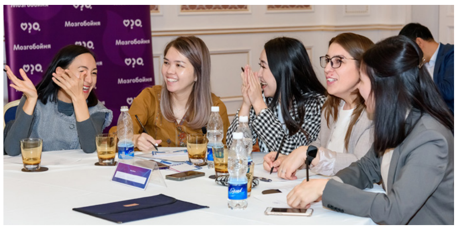
Members of UCA team at AKDN Quiz Competition.

UCA employees participated in a quiz competition in Bishkek organised for agencies of the Aga Khan Development Network (AKDN). The event brought together over fifty participants who competed by showcasing their general knowledge of world's history, arts and music as well as AKDN's work in Kyrgyzstan.