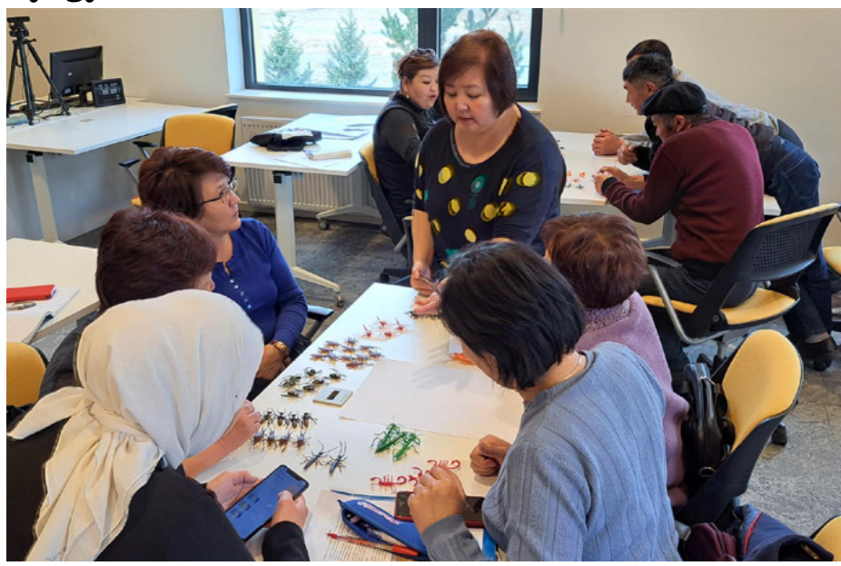
Biology teachers from high schools across the region at the Naryn Campus attending STEM pedagogical training.

The ability to think critically and challenge standards is a basis of innovation. Considering the gaps between knowledge delivered through educational systems and talents required at workplace, science, technology, engineering, and mathematics (STEM), education plays an increasingly important role in helping students acquire needed 21st century skills.