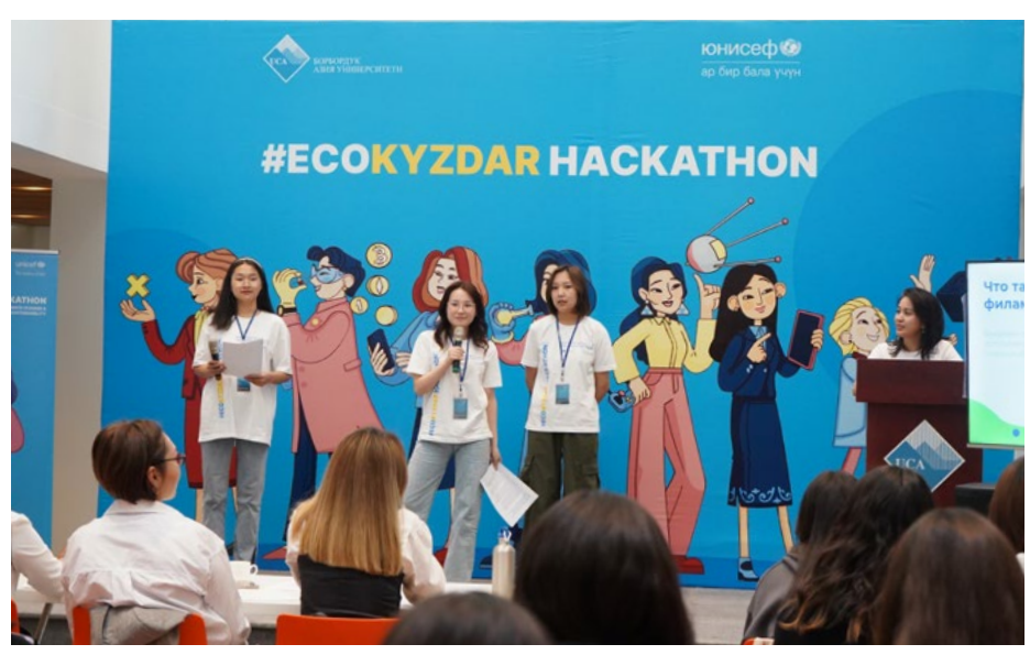
Young girls pitching their recycling project "Converting Plastic Bottles into Filament" to the panel of experts.

"At UCA, we recognise that achieving gender equality requires more than providing 'equal' opportunities. By creating a programme exclusively for young women, we aim to address the gender-based inequities that exist in STEM fields and provide a more level playing field for young women to succeed. This effort contributes to the broader vision of the UCA Chancellor, His Highness the Aga Khan, who emphasises that building a more inclusive and pluralistic