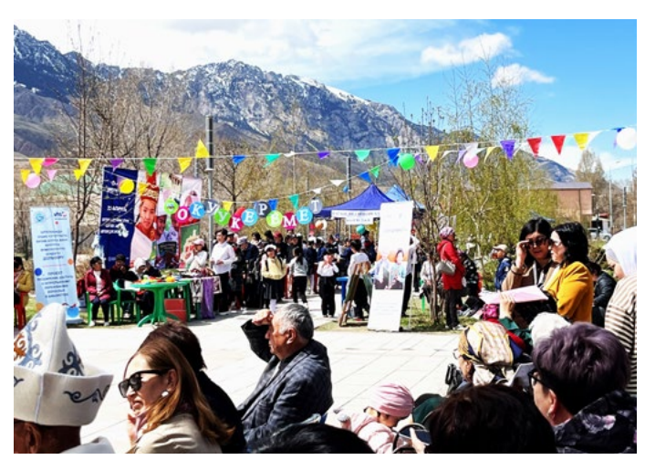
Celebration of World Book and Copyright Day in Naryn.

In his remarks at the Naryn event, the UCA Librarian spoke about the importance of reading, the role of books in an individual's life, and the issues associated with copyrights. The event contained storytelling and book reading sessions alongside a display of products and activities prepared by local librarians and community members. On this occasion, UCA also conducted a Master Class on Book Reading in the Kyrgyz language for young participants of the event.