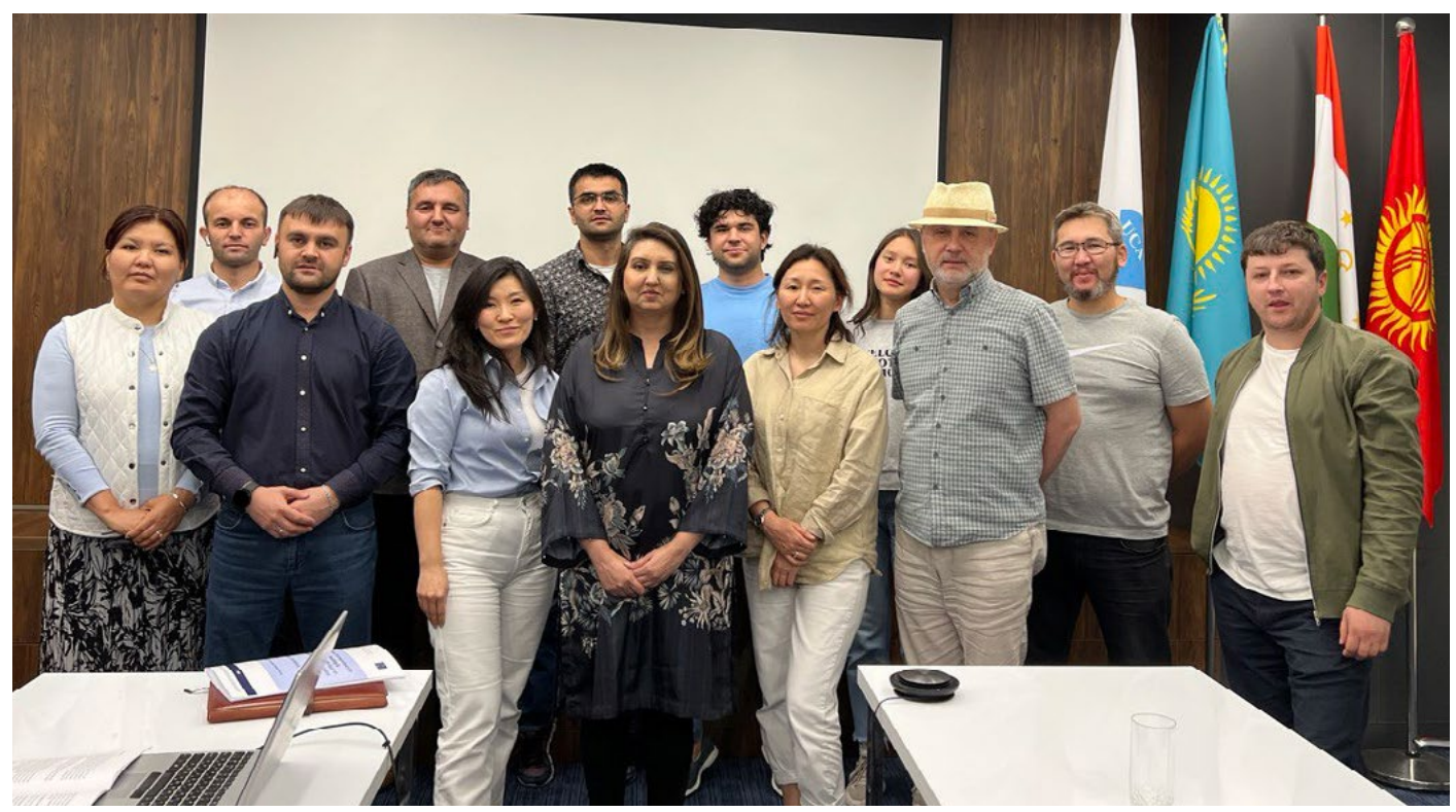
Participants of the first cycle of SPCE Executive Entrepreneurship programme in Green Technologies.

UCA's School of Professional and Continuing Education (SPCE) launched its first cycle of Executive Entrepreneurship courses, focused on green technology solutions in the construction sector. The aim of this programme is to promote eco-friendly construction technologies, especially in Kyrgyzstan, Tajikistan, Afghanistan, and Pakistan. These trainings,