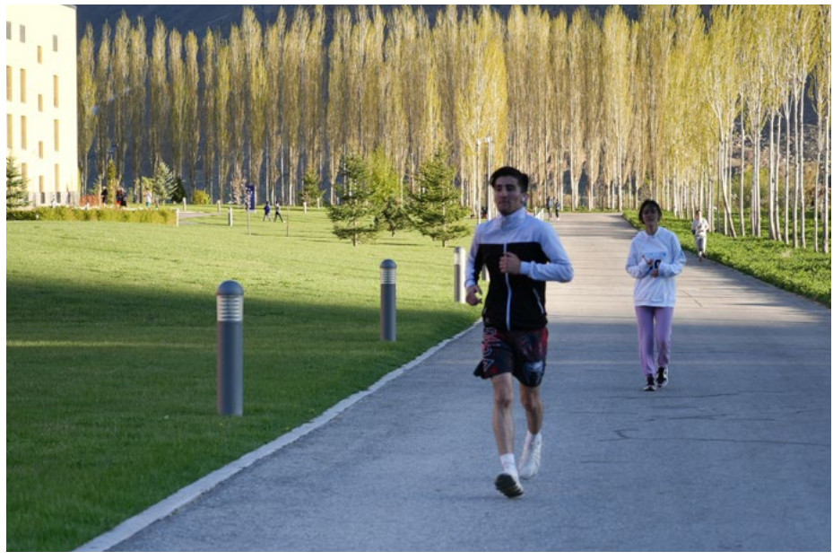
UCA staff participating in Jaz Demi Marathon.