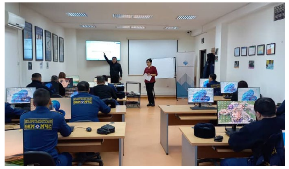
Training for officers of the Ministry of Emergency Situations at SPCE's Campus in Naryn.

To enhance digital skills among civil servants in Kyrgyzstan, the University of Central Asia (UCA) in collaboration with the Ministry of Digital Development has launched a series of training as part of the "Digital Central Asia & South Asia (CASA) - Kyrgyz Republic" project. Half of the 1500 training participants are women.