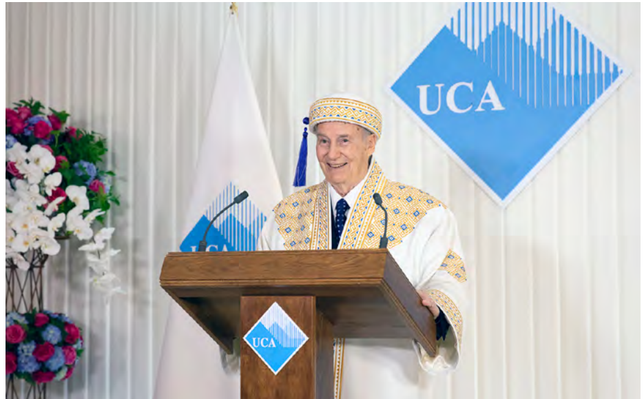
His Highness the Aga Khan, Chancellor of the University of Central Asia, addressing the Convocation. Read full speech in English and Russian or watch the video in English .

"This happened because the societies were open to new ideas, open to change, open to scholars and people from many backgrounds. That kind of openness can again unlock the doors to the future, and