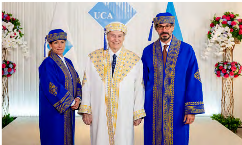
His Highness the Aga Khan in the Chancellor's gown, and Princess Zahra Aga Khan and Prince Rahim Aga Khan wearing trustee gowns.

One of the highlights of the First Convocation of UCA was the newly designed graduation gowns and caps. The gowns, reflecting UCA colours of light and dark blue, were the result of over a year of research, design, and refinement. Special attention was given to the motifs incorporated into the design to ensure they reflected the rich decorative traditions of Central Asia as a whole. These were blended into bands and other embellishments so that the gowns and caps are unique to the University of Central Asia.