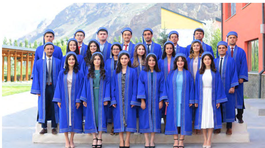
Graduates of the Class of 2021 show off their newly designed gowns.

winner. He worked closely with UCA to refine and blend the design which resulted in the final presentation.