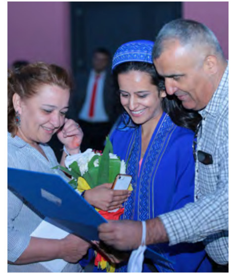
Proud parents admiring their daughter's UCA Degree.