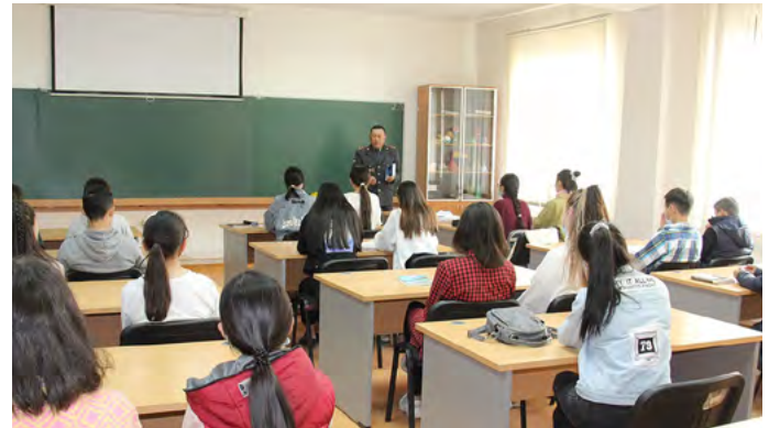
SPCE students and staff listen intently to a lecture on Internet security and privacy.

The fear of someone hacking into your bank accounts, or wiping out your hard drive, increases every day as new horror stories come to light. The pace of digital fraud appears to be keeping pace with digital innovation.