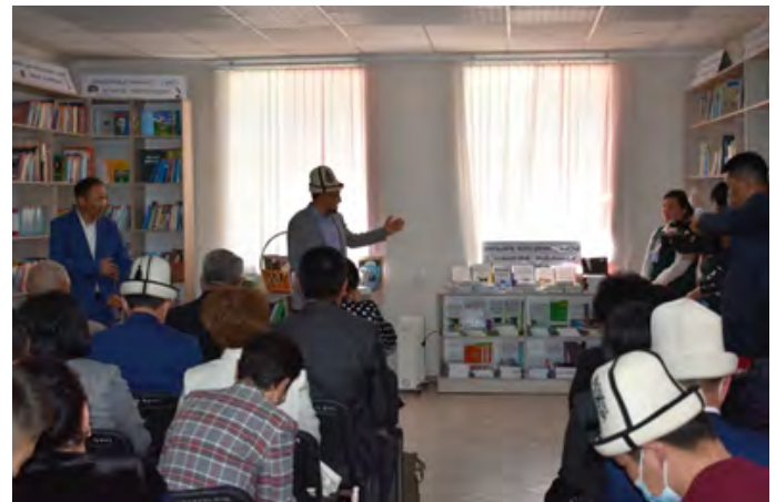
Inauguration of NSU’s digital library.

Working towards a vision of developing mountain communities, Naryn State University (NSU) inaugurated a digital library in April as part of UCA’s Mountain Universities Partnership (MUP) programme.