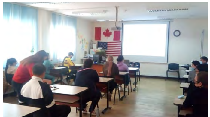
Students taking IELTS exam at SPCE Tekeli.

The UCA's SPCE in Tekeli, Kazakhstan, has signed an agreement with InterPress international language centre to hold International English Language Testing System (IELTS) exams at SPCE. This is the first time such an initiative has been implemented at Tekeli.