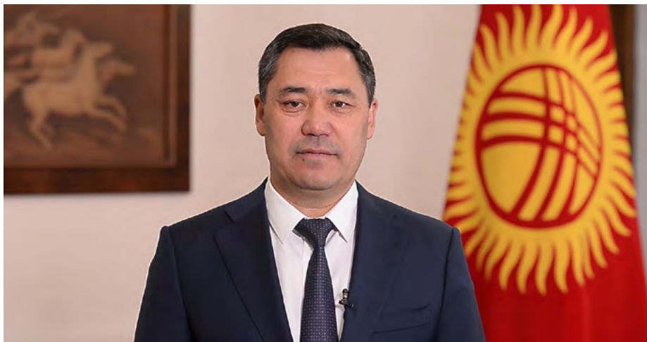
His Excellency Sadyr Japarov, President of the Kyrgyz Republic, conveying his message of congratulations to the graduates. Read full speech in English and Kyrgyz .

allows us to take on the great questions of our time and place."