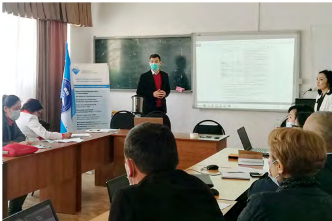
Participants at the entrepreneurship training.

The Naryn Centre for Entrepreneurship (NCE), the Aga Khan Foundation Kyrgyzstan, and the Mountain Societies Development Support Program (MSDSP) organized an entrepreneurial training for the Naryn State University’s rector, management, faculty, and staff to initiate an open public dialogue with potential entrepreneurs. The objective was to provide them with technical training on how to seek grants and write project proposals, and to inspire them by available sources of financing as well as resources at NCE.