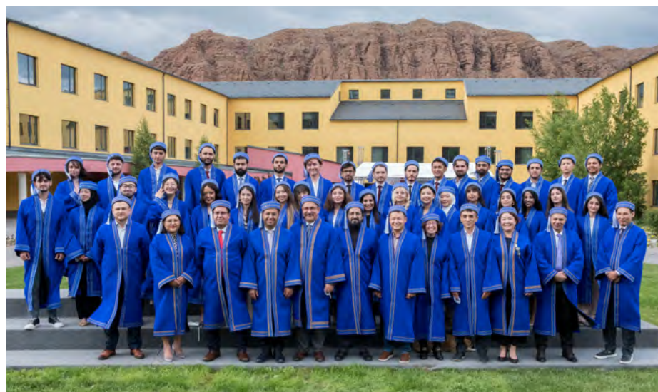
Photo above: UCA Faculty and Students during the Convocation in Naryn, Kyrgyzstan.