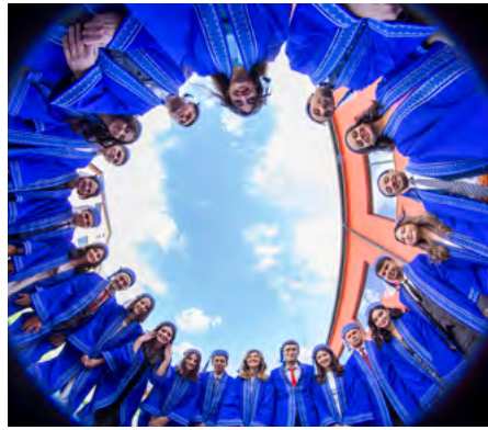
Graduates circle a camera.

Looking ahead, the mountain communities of Central Asia continue to face a