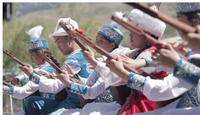
Musical concerts at museums can be an attractive way to draw audiences.

Covid-19 has had an impact on all sectors of the socio-economic spectrum, including museums. UCA’s Cultural Heritage and Humanities Unit has been exploring ways to enhance the experience of visiting museums, and organized an online conference on May 17th, 2021, “The Future of Museums: Experience and Development Trends.”