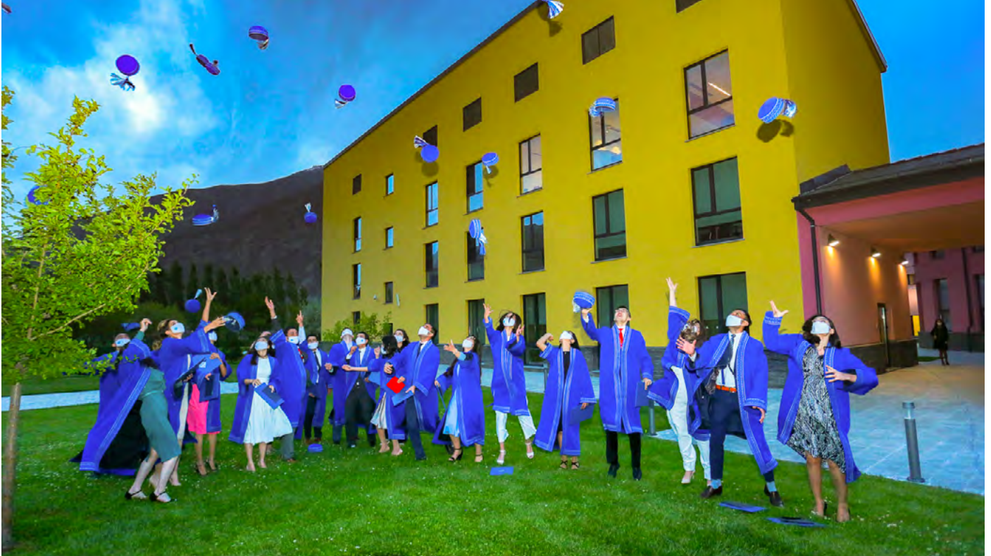
UCA graduates celebrate with hats in the air.

Against the backdrop of snow-capped mountains, the University of Central Asia (UCA) celebrated the achievements of its inaugural cohort of graduates: the Class of 2021. The live-streamed Convocation brought together students, family members, faculty, and well-wishers across multiple countries and time zones around the world.