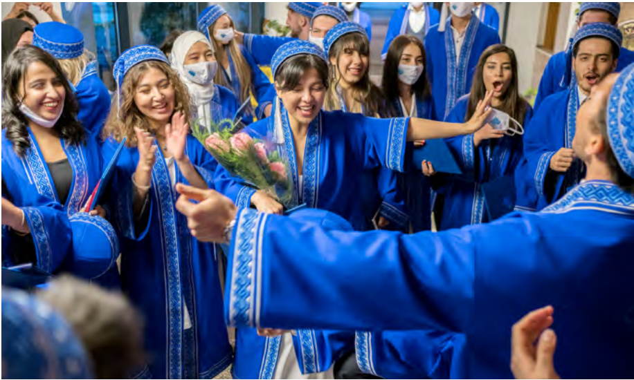
Graduates in Naryn break into a spontaneous celebration.