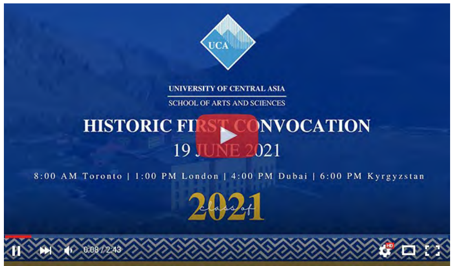
Full video of speeches and events at the Historic First Convocation of UCA.

dors and alumni of UCA, would play a special role in addressing these challenges, “This is a special responsibility that I am certain you will be able to fulfil admirably.”