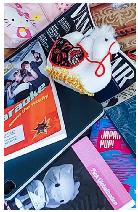
Symbols of popular culture

To learn more about the festival and submit entries for the film festival and poetry competition, please visit here <a href="http://www.ucentralasia.org/nomad2023">http://www.ucentralasia.org/nomad2023</a>.