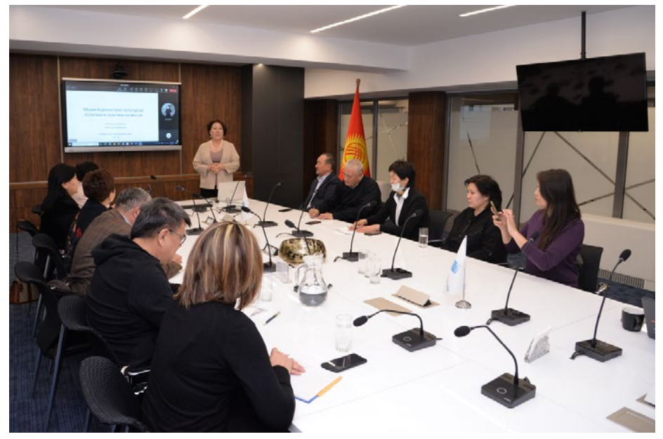
Participants at the CHHU Presentation

A recent study on cultural policies and museum practices in Kyrgyzstan was presented by UCA's Cultural Heritage and Humanities Unit (CHHU) at an event in Bishkek on February 7 which was attended by directors of museums from urban and rural areas of the country. The study aims to generate new knowledge, enhance professional links between museum specialists and improve museum policies.