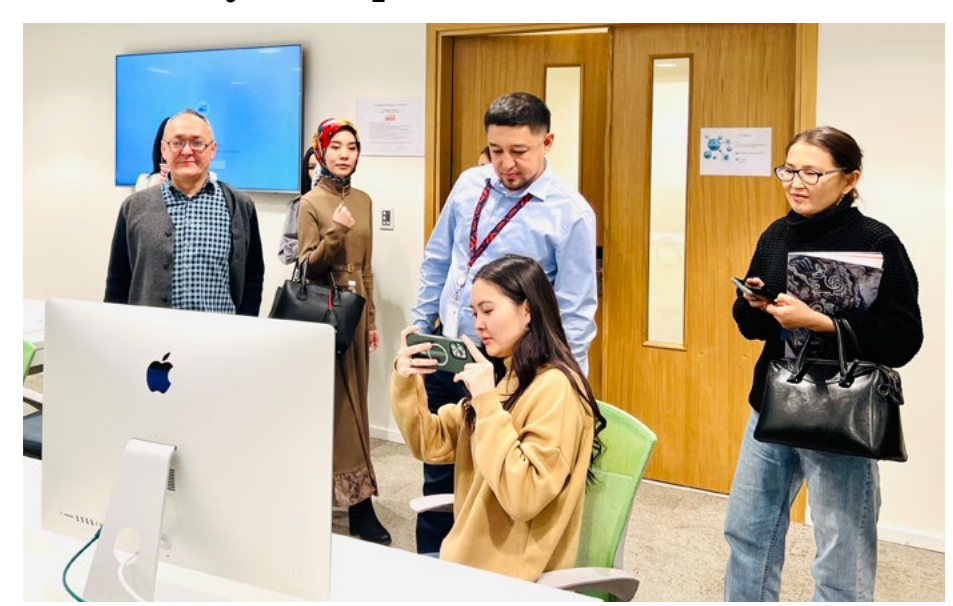
Visitors learn about innovative technologies and resources offered at UCA's Media Lab.

The AKIpress delegation engaged in discussions with UCA students, addressing topics ranging from the current state to future prospects for the development of media and communications in Kyrgyzstan and the broader Central Asian region. The journalists also had the opportunity to visit UCA's SPCE, Aga Khan Medical and Diagnostic Centre, and Naryn Park rehabilitated by the Aga Khan Trust for Culture, to learn more about the diverse programs